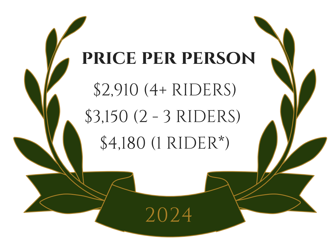
The above rate includes:

5 Nights Accommodation (sharing)**: 3 Nights North Coast + 2 Nights Castle Leslie, 3 Days Riding North Coast + 2 Days Riding Castle Leslie (2 Estate Treks <u>or</u> 1 Estate Trek/1 Cross Country Jumping) + Daily Pickup/Drop off to Ride Locations on North Coast + Horse Hire + Tack & Equipment + Picnic on North Coast + Daily Full Irish Breakfast on North Coast & Castle Leslie x 5 +