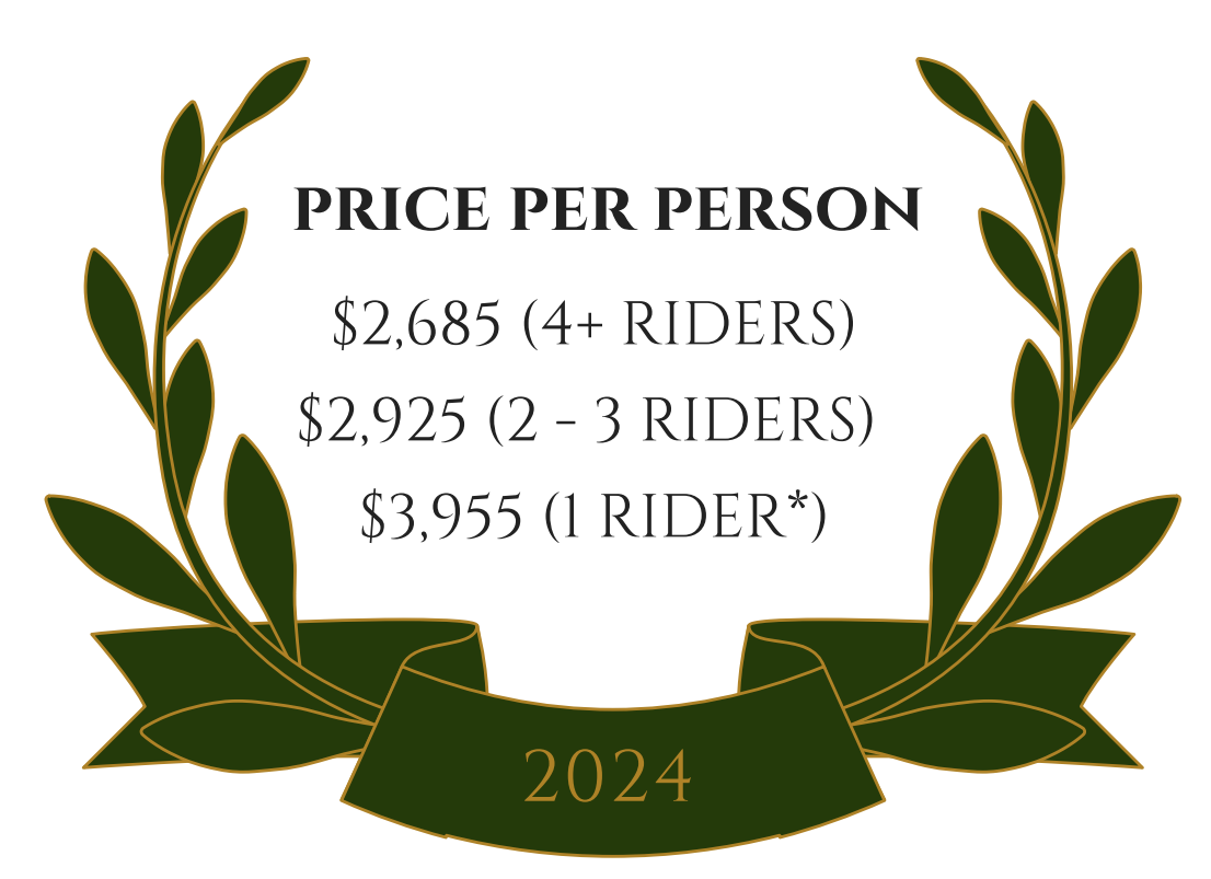
The above rate includes:

5 Nights Accommodation (sharing)**: 3 Nights North Coast + 2 Nights Castle Leslie, 3 Days Riding North Coast + 2 Days Riding Castle Leslie (2 Estate Treks <u>or</u> 1 Estate Trek/1 Cross Country Jumping) + Daily Pickup/Drop off to Ride Locations on North Coast + Horse Hire + Tack & Equipment + Picnic on North Coast + Daily Full Irish Breakfast on North Coast & Castle Leslie x 5 +